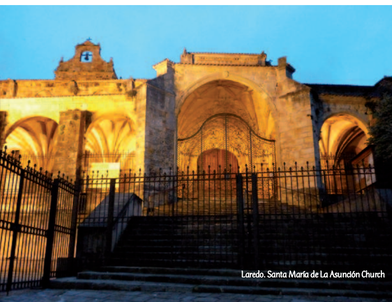
Laredo. Santa María de La Asunción Church

A city of great historical importance, there are many reasons why it is worth getting to know. Stately homes and palaces bear witness to the importance once held by the court in the life of the town. Tordesillas is a fascinating town whose place in history is secure for two reasons: firstly, because after a series