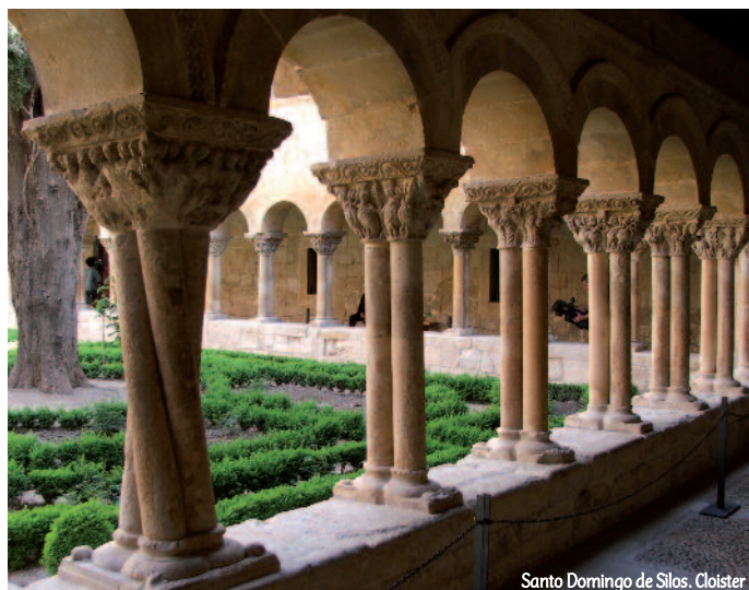
Santo Domingo de Silos. Cloister

Continue to Santo Domingo de Silos for overnight.