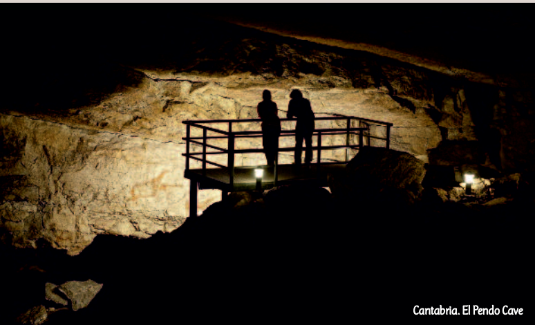
Cantabria. El Pendo Cave