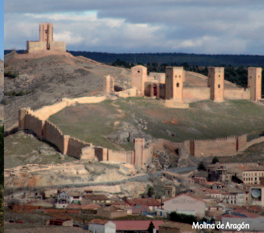
Molina de Aragón