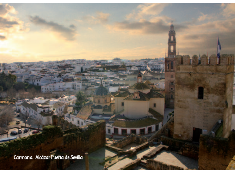
Carmona. Alcazar Puerta de Sevilla

Today we will transferred to the Málaga Airport for our return flight.