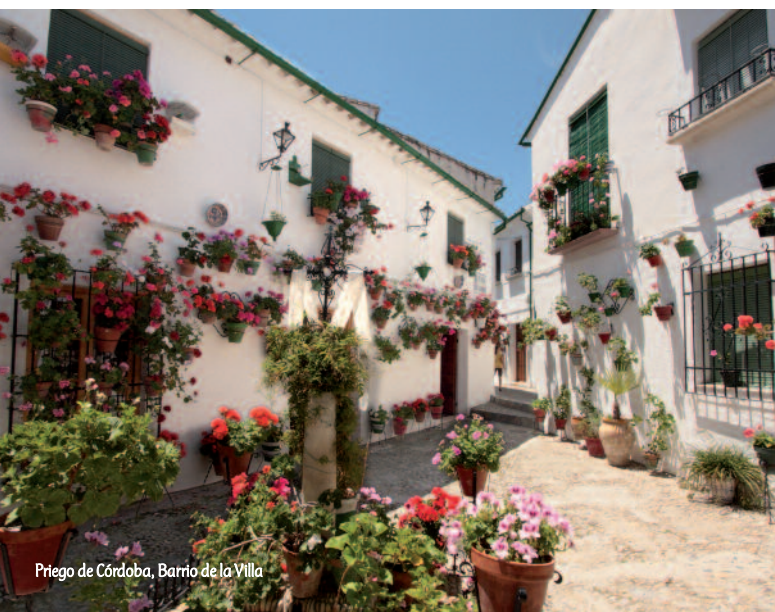
Priego de Córdoba, Barrio de la Villa