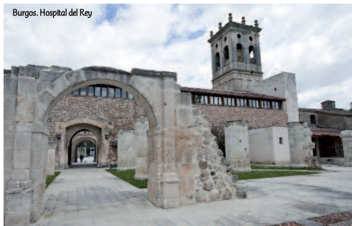
Burgos. Hospital del Rey

In the afternoon continue to Jarandilla de la Vera for overnight.