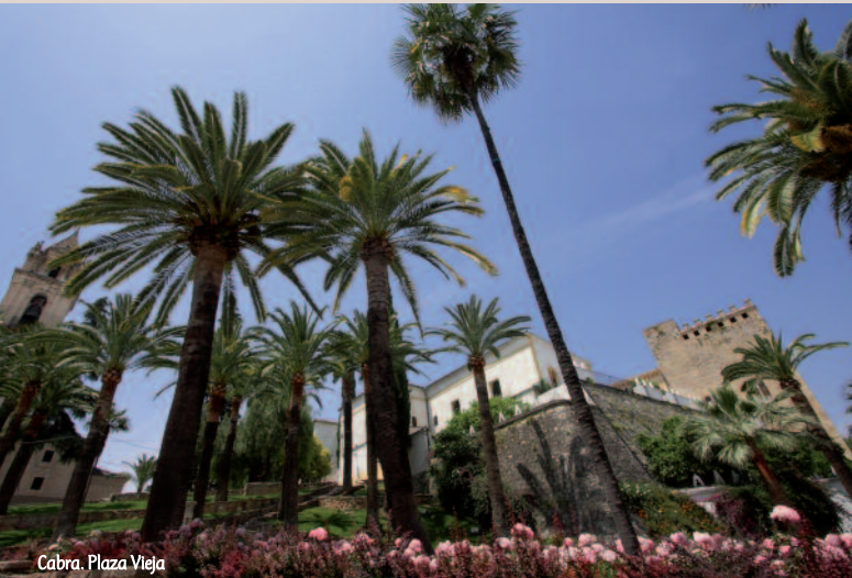
Cabra. Plaza Vieja

For one week a year the towns recreate the birth, life, passion and death of Christ in its own way, displaying the artistic wealth of its images, the quality of its musical compositions and the individuality of its most deep-rooted customs.