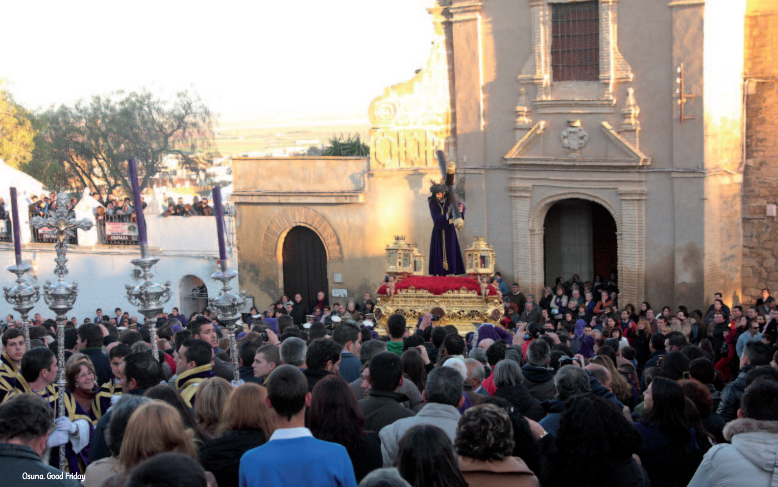
Osuna. Good Friday

The Association of Easter Week brotherhoods from Baena has created a permanent exhibition on the local Easter Week traditions, declared as being of national touristic interest.