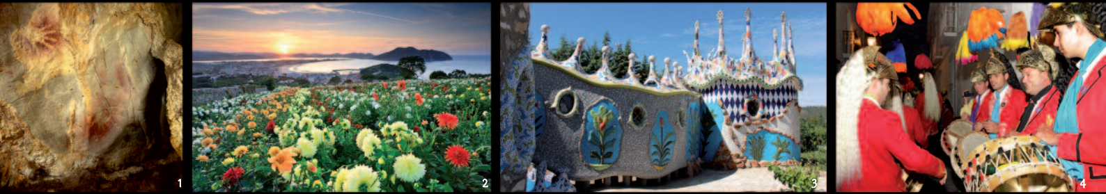
1. Cantabria, El Castillo Cave / 2. Laredo / 3. Santos de Maimona, Capricho de Cotrina / 4. Baena, Easter