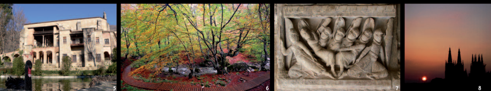
5. Yuste Monastery / 6. El Faedo de Ciñera. Author: Miguel Aguilar / 7. Abbey of Silos / 8. Burgos

C/ Papín, 22 - Bajo - E- 37007 Salamanca - Spain Tel. +34 923 282 511 - Fax +34 923 282 610