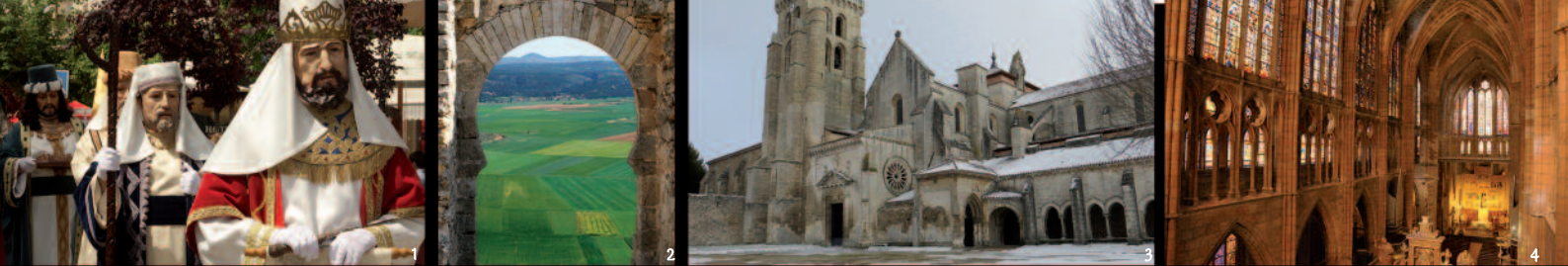
1. Puente Genil, Easter / 2. Gormaz Castle / 3. Burgos, Las Huelgas Monastery / 4. León, Cathedral. Author: Sergio Reyes Pérez

Pilgrimage & Spiritual Tours • Choral & Music Tours Tailor Made Tours • Cultural, Study & Art Tours Wine & Gourmet Tours